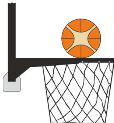
Diagram 2 Ball in contact with the ring

31-15 Statement. Interference is committed by a defensive or offensive player during a shot for a field goal when a player touches the basket or the backboard while the ball is in contact with the ring and still has a possibility to enter the basket.