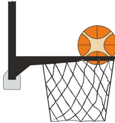
Diagram 3 Ball is within the basket

31-21 Statement. It is an interference violation if a defensive player touches the ball while the ball is within the basket.