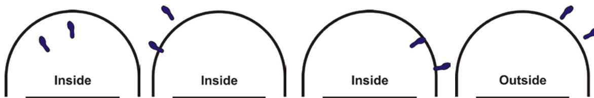
Diagram 4 Position of a player inside/outside the no-charge semi-circle area

Interpretation: A1's legal action. The no-charge semi-circle rule is applied.