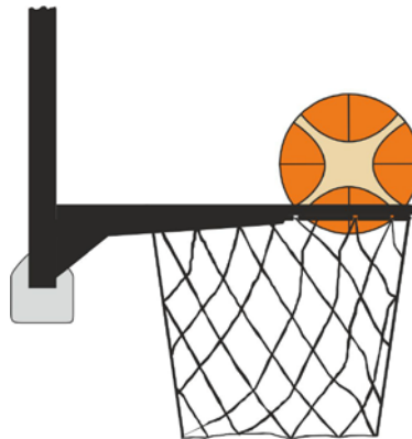
Diagram 3 Ball is within the basket

31-17 Statement It is an interference violation if a defensive player touches the ball while the ball is within the basket.